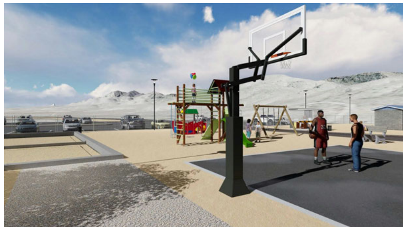
Rendering by Sam Lytle, CivilFX.com

A jungle gym, volleyball pit and basketball court will be constructed at the northwest portion of the property.