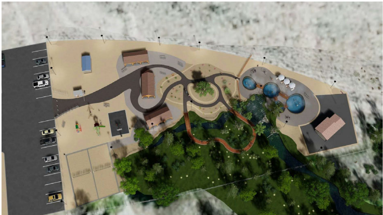
Proposed changes to Little Ash. Rendering by Sam Lytle, CivilFX.com

The Development areas support site management, operation and services as well as recreational opportunities to site visitors.