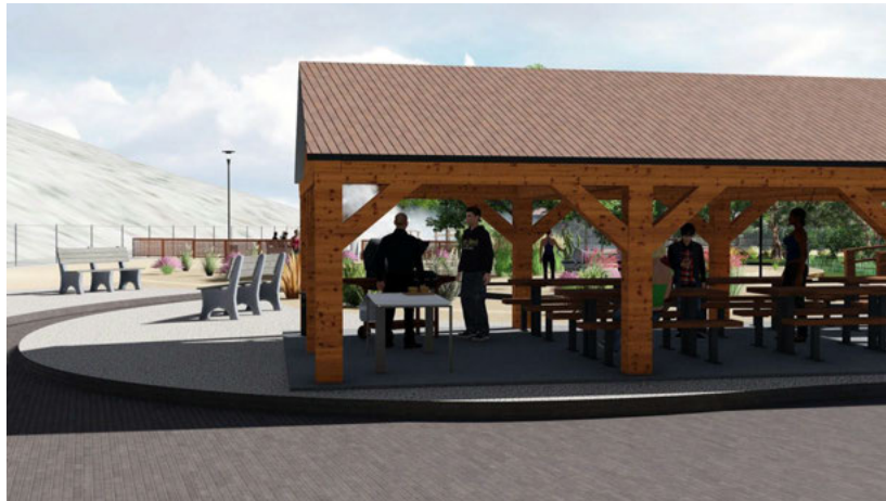
Rendering by Sam Lytle, CivilFX.com

Three pavilions will be constructed that can accommodate approximately 20 people each. These will be placed northeast of the property just south of the existing restroom facilities.