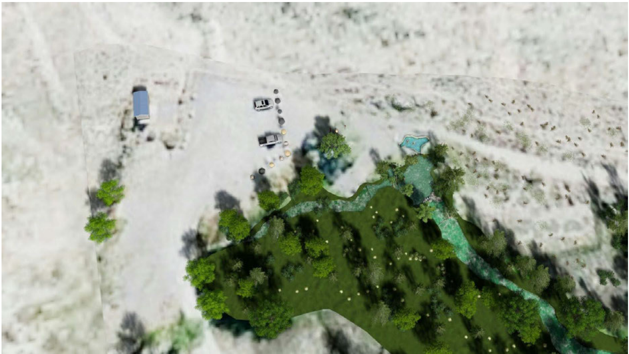
Aerial rendering of Little Ash in its current state.

Little Ash Spring has been officially closed since the summer of 2013 with the Bureau of Land Management, Caliente Field Office citing public health and safety concerns.